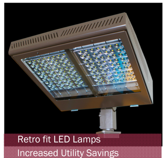
Retro fit LED Lamps Increased Utility Savings

The payback period for this modification including rebates secured from the local utility provider was less than two years.