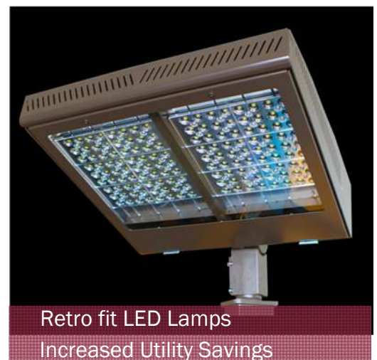
Retro fit LED Lamps Increased Utility Savings

The payback period for this modification including rebates secured from the local utility provider was less than two years.